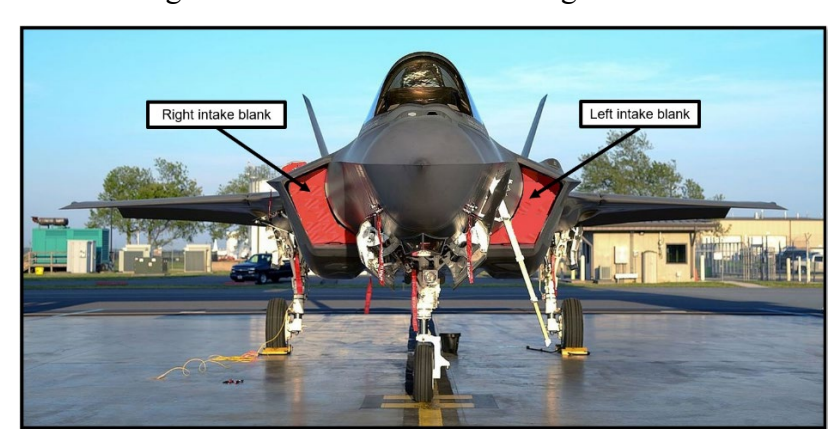
Figure 1: Representative image of an F35 with intake blanks fitted.

To conduct the engine inspection, Eng 1 removed the right intake blank (Figure 1) and climbed down the intake to gain access to the front face of the engine. On completion of this task, they took the right intake blank down to the hangar for storage. When Eng 2 came up on deck to conduct their element of the servicing, they found the exhaust blank on the deck a couple of metres behind the aircraft. Eng 2 safely stowed this blank and upon completing their servicing took it to the hangar for stowage. The exhaust blank was the only blank Eng 2 observed in or around BK18 that night. Their part of the servicing required climbing into the cockpit which involved considerable activity immediately adjacent to the left intake. Neither engineer reported interacting with the left intake blank during their elements of the servicing.