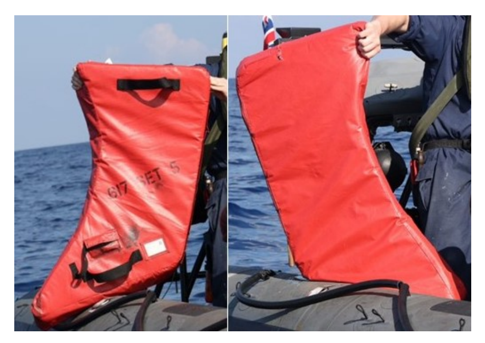
Figure 3: Left intake blank recovered from the sea.