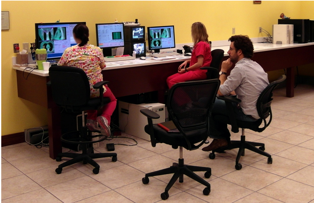
Figure 1 – Observations in control room