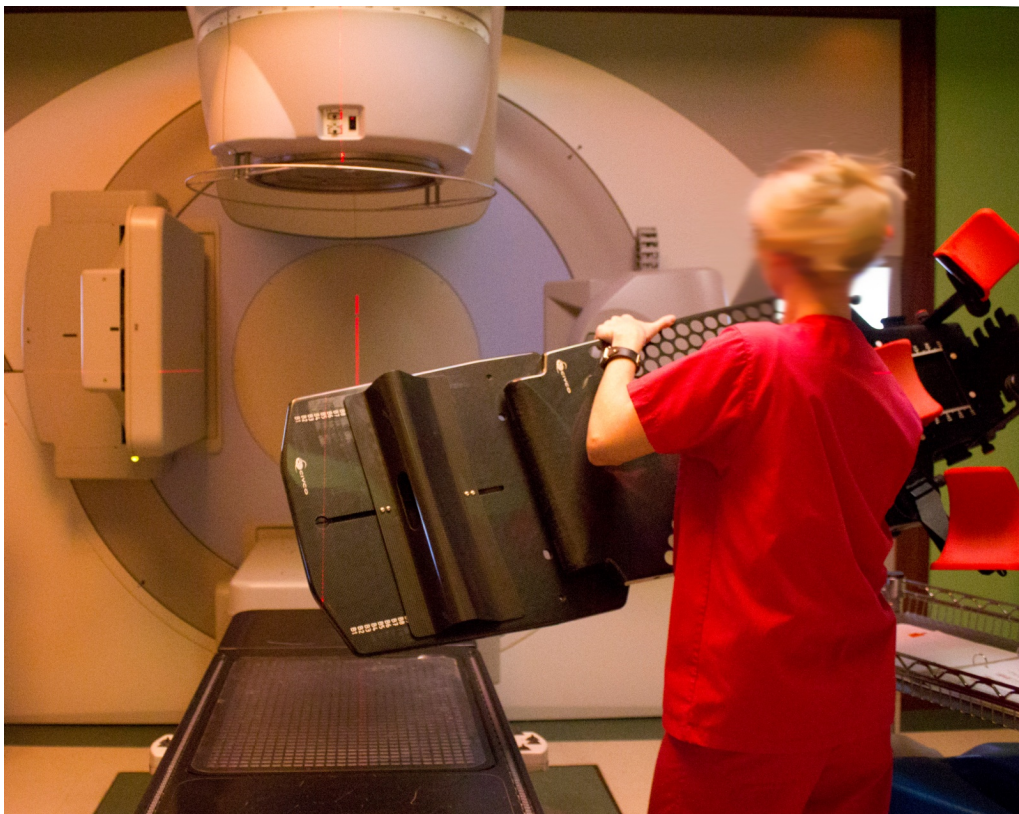
Figure 2 – Observing equipment setup in treatment room

The data collected was analysed using a range of human factors tools to identify opportunities for improvement and, more critically, unmet needs. The hierarchy placed on these needs by different stakeholder needs were explicitly considered. This included the needs of patients, healthcare practitioners (HCPs) and healthcare providers (system owners). Extensive modelling of the current system and the measurement of its performance, were a critical first step to form a baseline of system performance. By measuring and estimating the performance of existing systems for efficiency, efficacy, errors, staff convenience and patient comfort (see Figure 3), unique opportunities were identified for reshaping the system